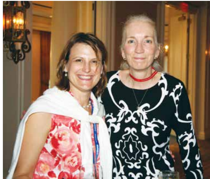
CPHQs celebrate at the annual CPHQ Reception.

The CPHQ program enjoyed another year of upward trends in 2012, gaining approximately 100 new CPHQs while maintaining a robust renewal rate of 72%. Although this rate is slightly lower than 2011, it continues to be higher than the national average. Several programming improvements, including an online recertification application, increased website usability and functionality, and increased communication with certificants, have helped these numbers grow. Persistent focus on a user-friendly process will continue to bode well for the program and increase the credential's value in the years to come.